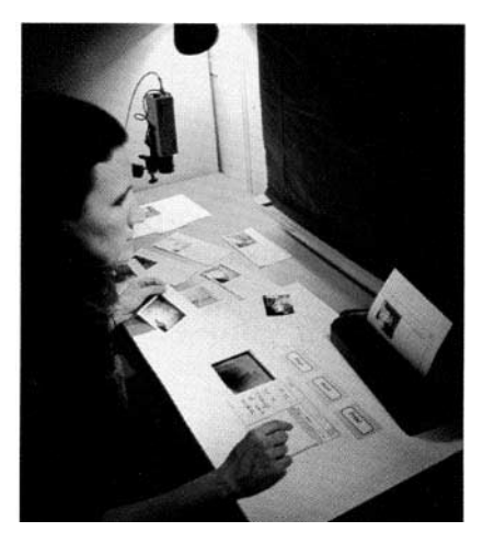
Figure B. Mosaic

opment of their videos. A storyboard consists of a set of elements, each containing a sketch or image of the "best frame" of the video, associated text, and notes that describe the action. Storyboards provide an efficient way to sketch action sequences and develop "what-if" scenarios; they are flexible, portable, and easily annotated. The designer can lay out a large number of storyboard elements and view multiple alternatives at the same time. However, there is no easy way to associate the offline storyboard with the video that has been created on-line. Therefore, video producers must move to a completely different system to view and edit the moving video.